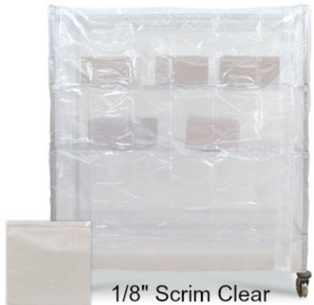
1/8" Scrim Clear