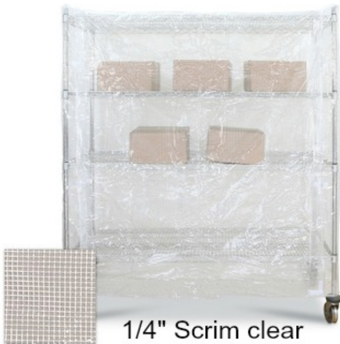
1/4" Scrim clear